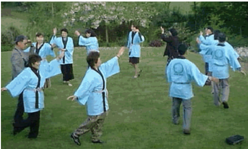
A traditional Bandai dance