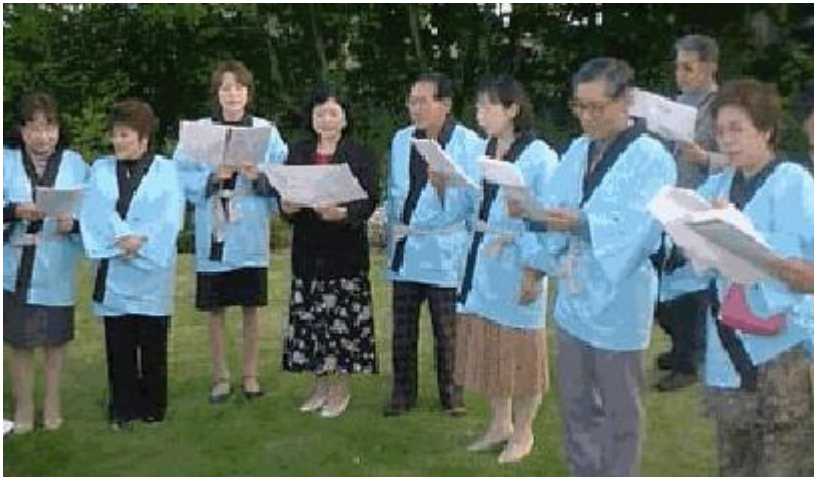
Our guests sang us a beautiful song of welcome in Japanese