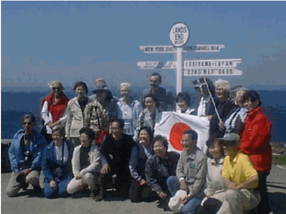
A brief stop at Lands End for a photograph. The sign may tell us that Koriyama is over 6000 miles away, but the friendships forged this week will make that distance seem small.