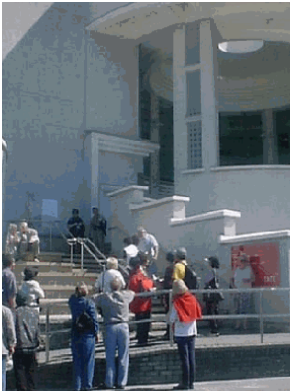
Finally on to St Ives for a surprise rendezvous at the Tate Gallery with old friends from F F Devon who had come down for the day.