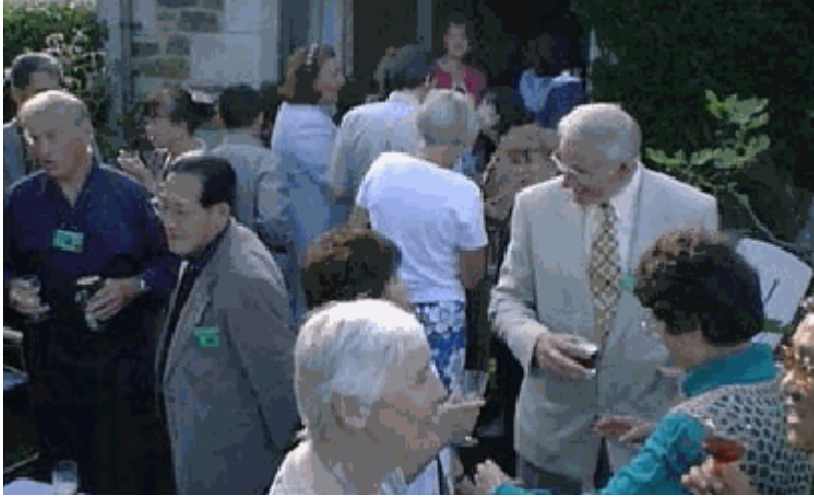
A glass or two of wine and we were all starting to relax